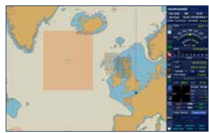
AIO (via C-Map CAES)