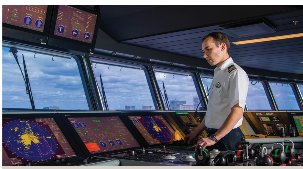
Integrated Bridge System on board the Allure of the Seas

Our integrated bridge consoles offer the ultimate in ergonomic design for ease of operation and maintenance, with the multi-function workstation TotalWatch using widescreen, highresolution monitors for greater visibility and situational awareness.